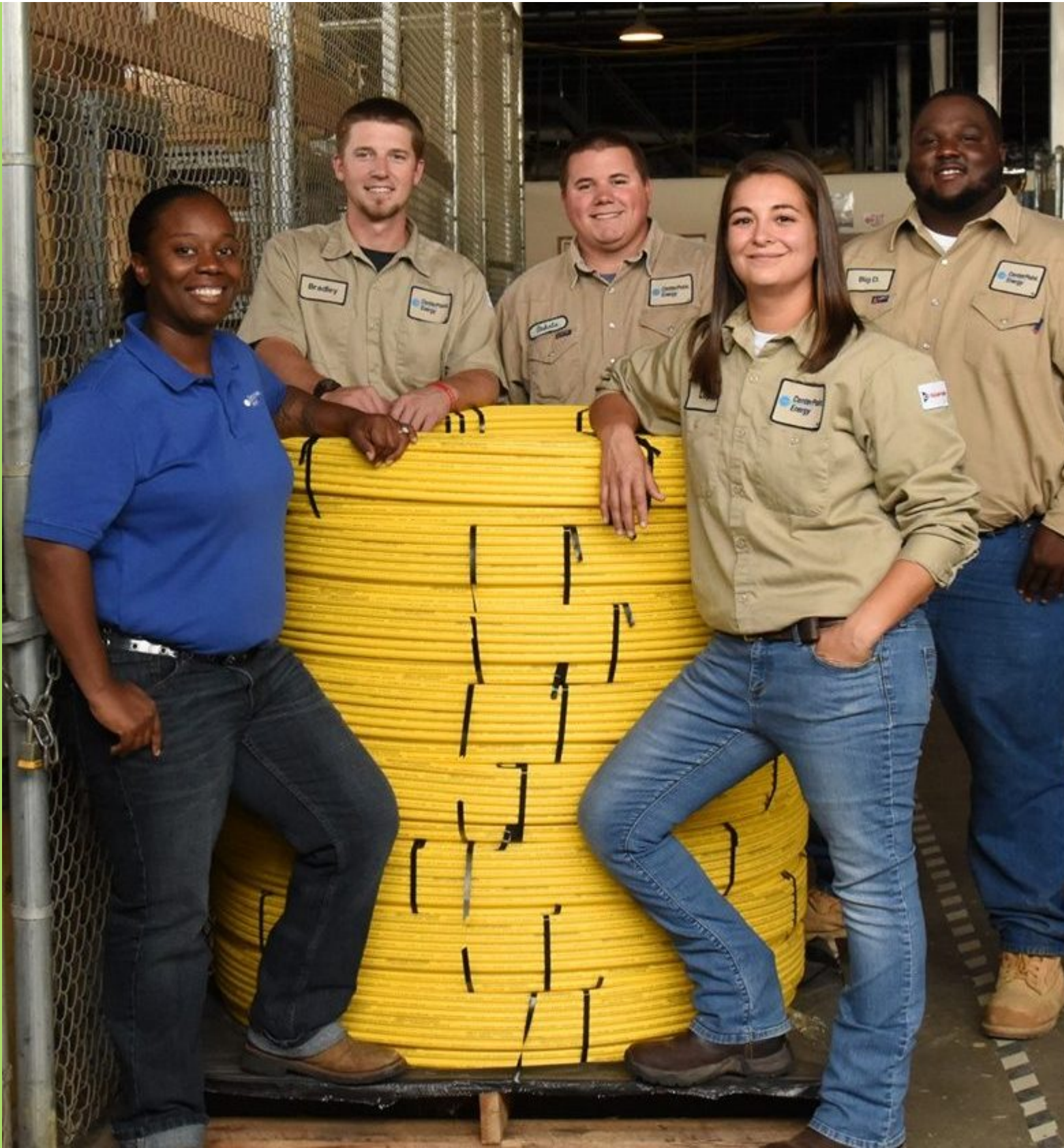
Diversity & Inclusion